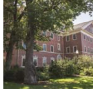
ELMINA WHITE HONORS